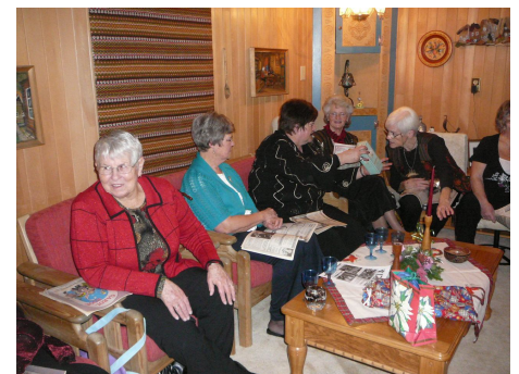
December 1st Ladies Christmas Party